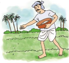
Scattering seeds in the ground for plant growth