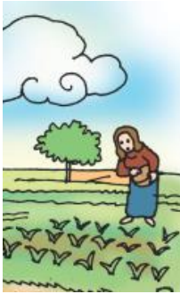
Adding manure to the soil