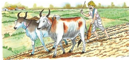
Loosening the soil