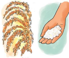
Cutting the crop when the seeds are ripe